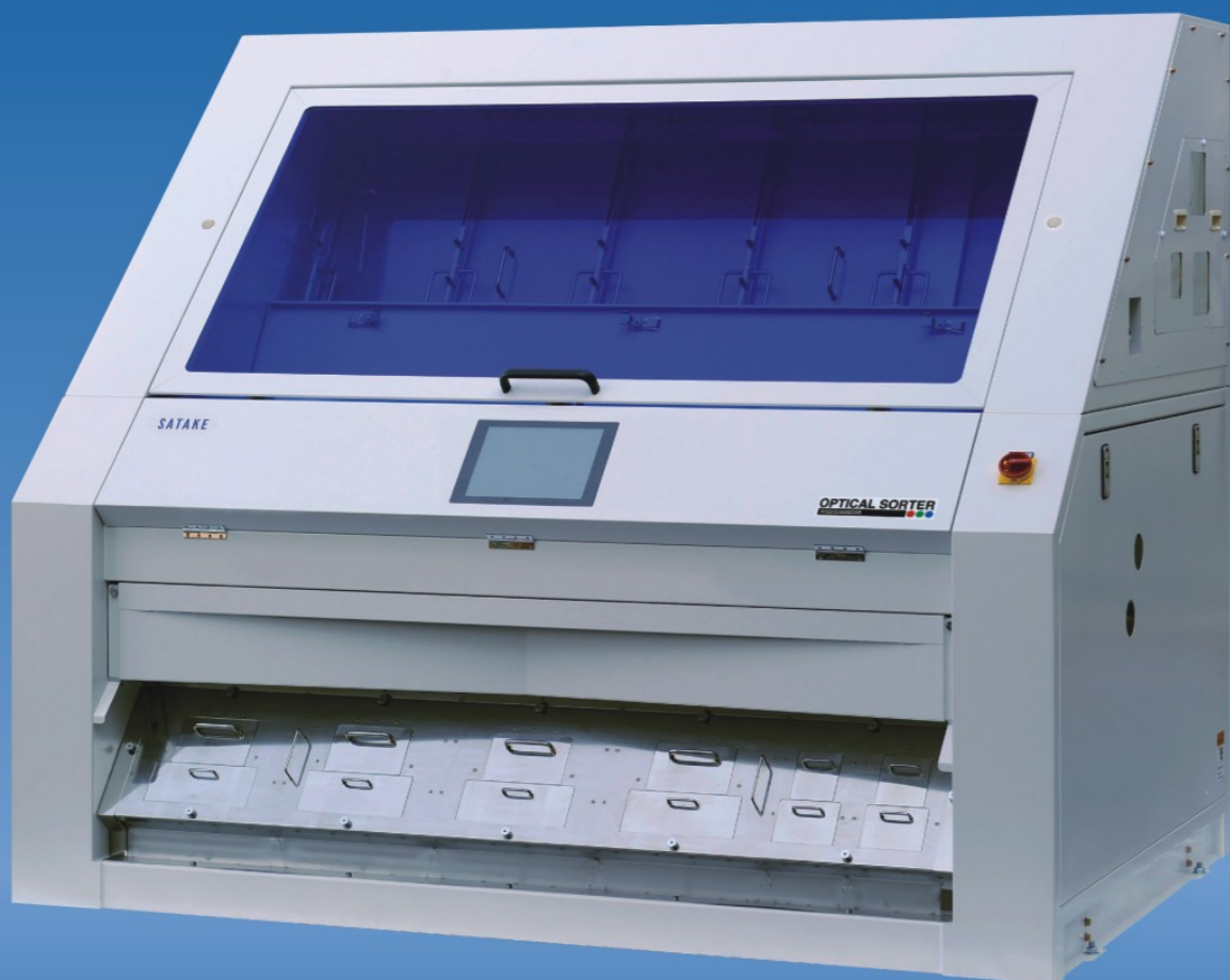
RGBOBS 5000 DIS RGBOBS 3000 DIS