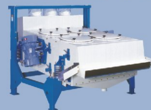
Milling Separator (SFI)

SATAKE also recommends following for the mill: